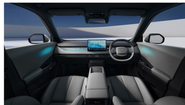
GREY AND BLACK