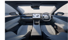
WHITE ( E2 540 ONLY )